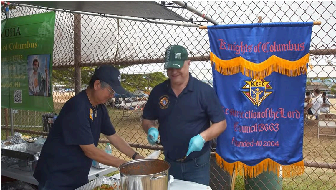
Knights from Resurrection of the Lord Council 13663 in Waipahu, Hawaii, prepare food for athletes participating in Special Olympics Hawaii's 30th annual Aukake Classic Games in August 2025.