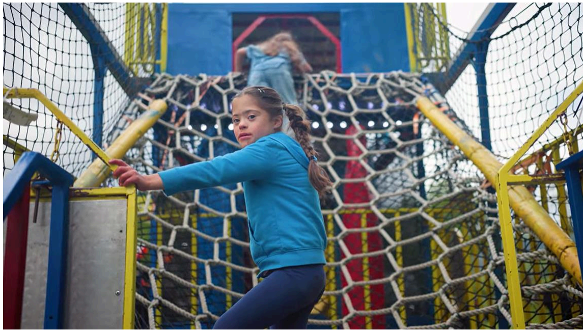
A girl plays on a climbing structure at the annual carnival hosted by Our Lady of Lourdes Council 5890 in Washingtonville, New York.